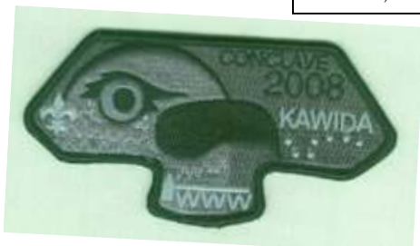
You came, you drove 8 hours, you lived through the rain, you got the patch.