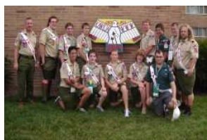
2006 NOAC Contingent Kawida Lodge Michigan Sate University