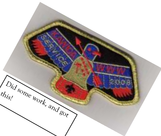
Did some work, and got this!