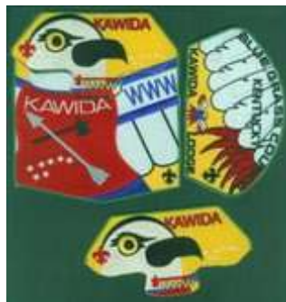
Kawida Lodge Patch Set! Includes Council Flap!