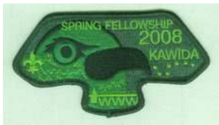
New Vigil Member? You should have this patch!