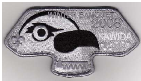
Can't say much about this patch, just be sure to be there!