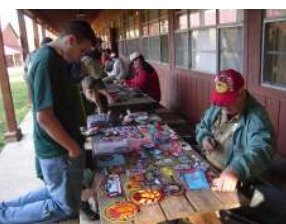
Patches from every lodge is at your reach!

tire weekend with everyone. At Conclave there are many things to do, such as fun games, training events, Indian type Workshops, great food, cool patches, and much more! More information will be coming out soon. See you there!