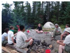
Kawida Lodge members chill at Northern Tier High Adventure Base this summer.