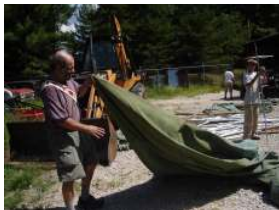
Fixing tents is a common thing at Camp McKee!

Pictured through out this page are projects or events during this last year. Enjoy!