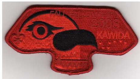
Survived the cold, caste a vote or two, and got out of there!