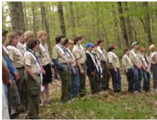
New OA Members lined up after receiving their sash.