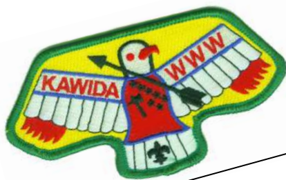
2008 Lodge Standard