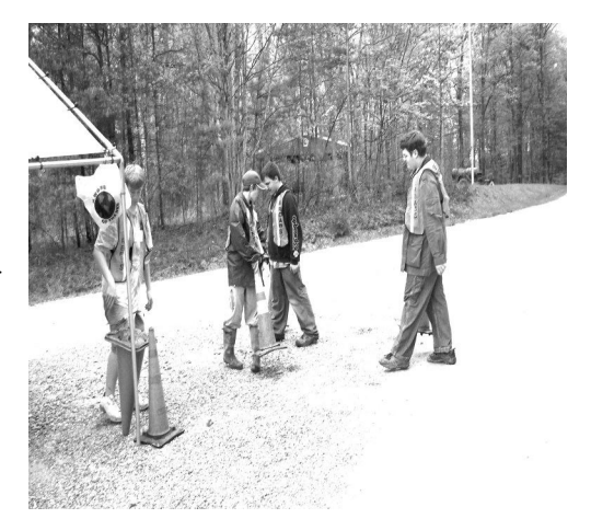
Kawida Lodge members help direct cars to the registration area.

Even though Kawida is not due up to be the service lodge for nearly another decade, we should be proud of our lodge and what it has accomplished. Conclave was a huge success and we should use it as a springboard into this upcoming year. 2004 looks to be a successful year. I say this to pass the fire of cheerfulness and willingness that has been brought to life since Conclave. Let's make this a memorable and exciting year for Kawida Lodge. I say this, and I know it won't be for the last time either, "job well done and mission accomplished. You all have done an awesome job!"