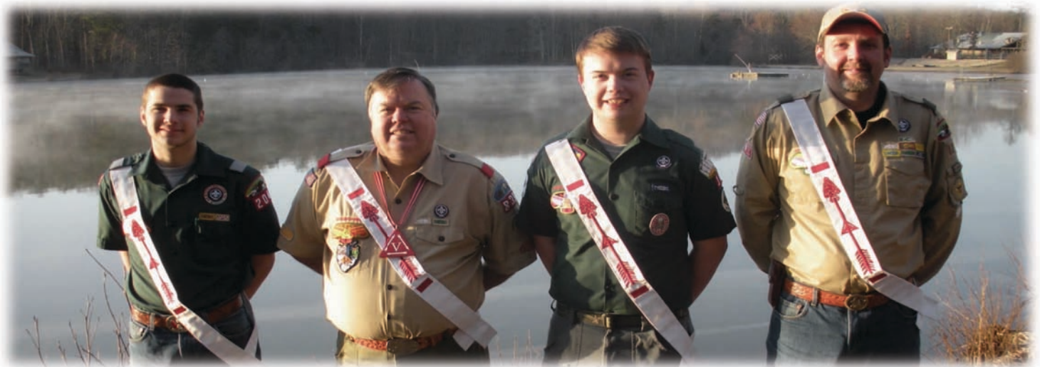
The 2009 Frank Seale Kawida Lodge Vigil Class!