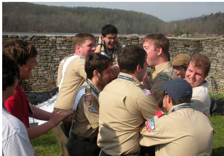
Someone's about to get dunked! Don't worry we took his iPhone and emptied his pockets.