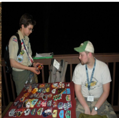
Someone's patch trading!